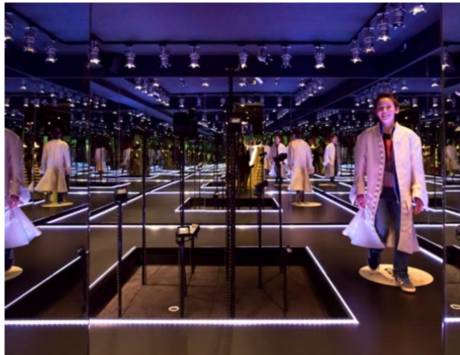
© Gemeentemuseum Den Haag - Wonderkamers

The museum is visited by over half a million visitors each year, among which 36,000 children and youngsters up to the age of 18.