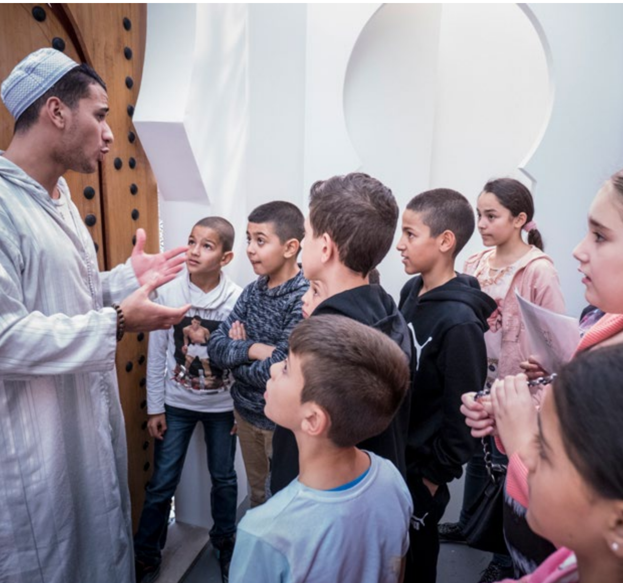
© Tropenmuseum Junior, Amsterdam by Ivar Pel