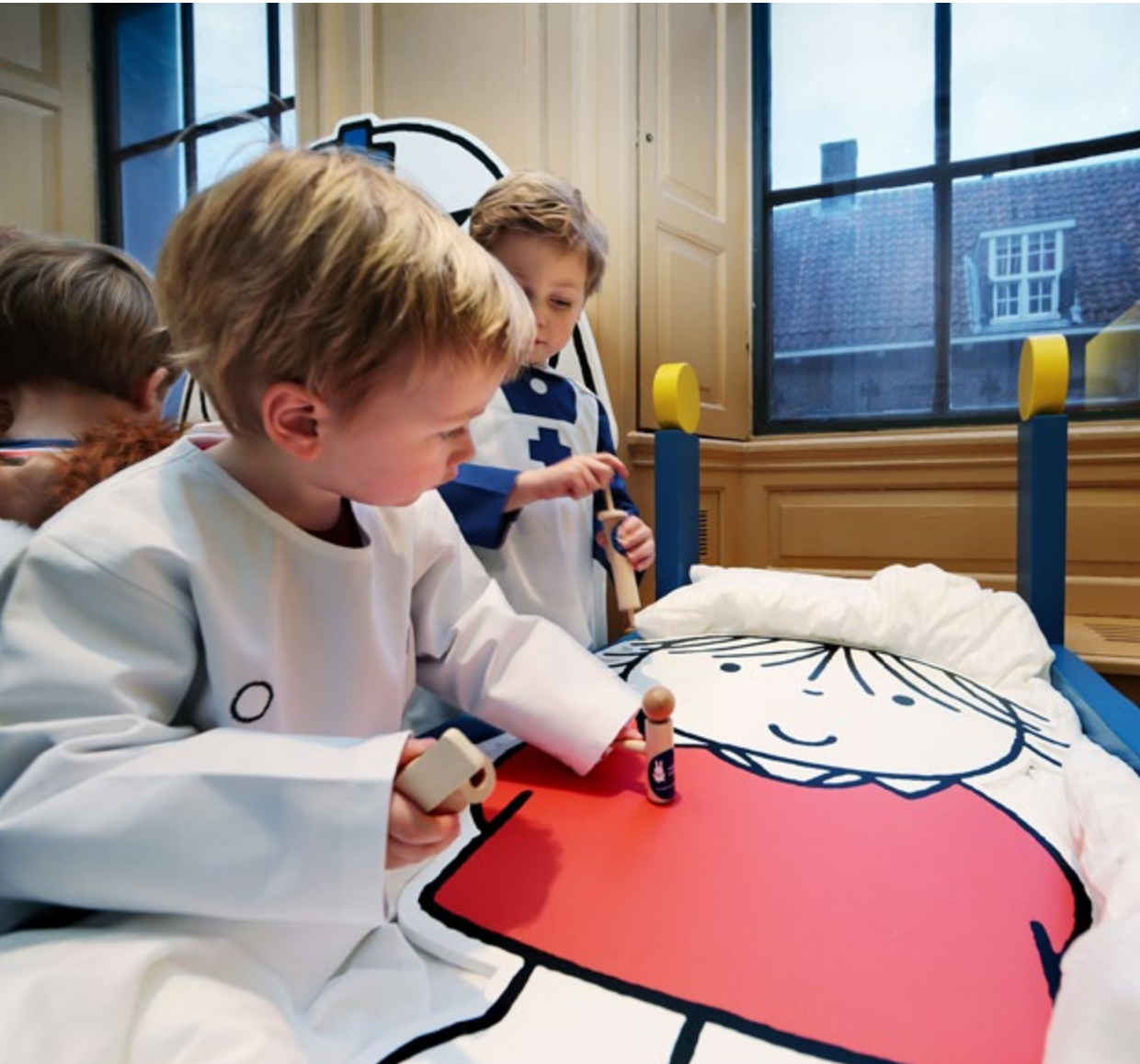
© Miffy Museum by Jean-Pierre Jans

Centraal Museum Agnietenstraat 2 3512 XB Utrecht, www.nijntjemuseum.nl